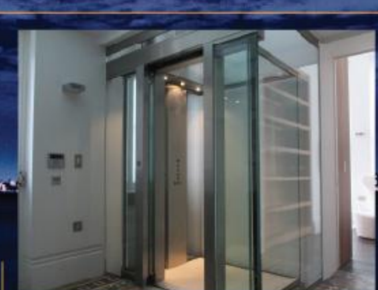
LIFT WITH Power Backup