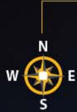
Type - A EAST FACING FLOOR PLAN