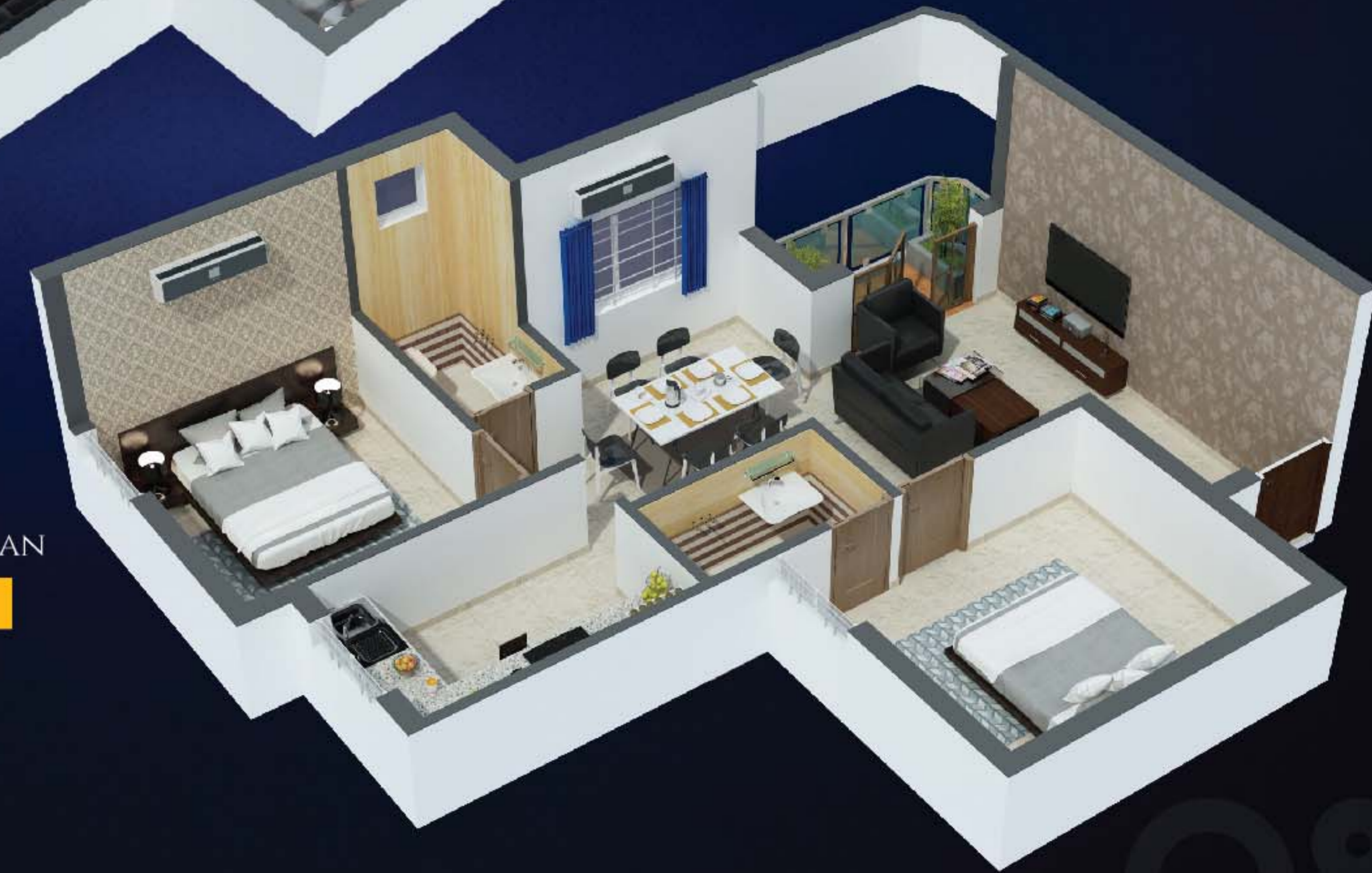
3D FLOOR PLAN