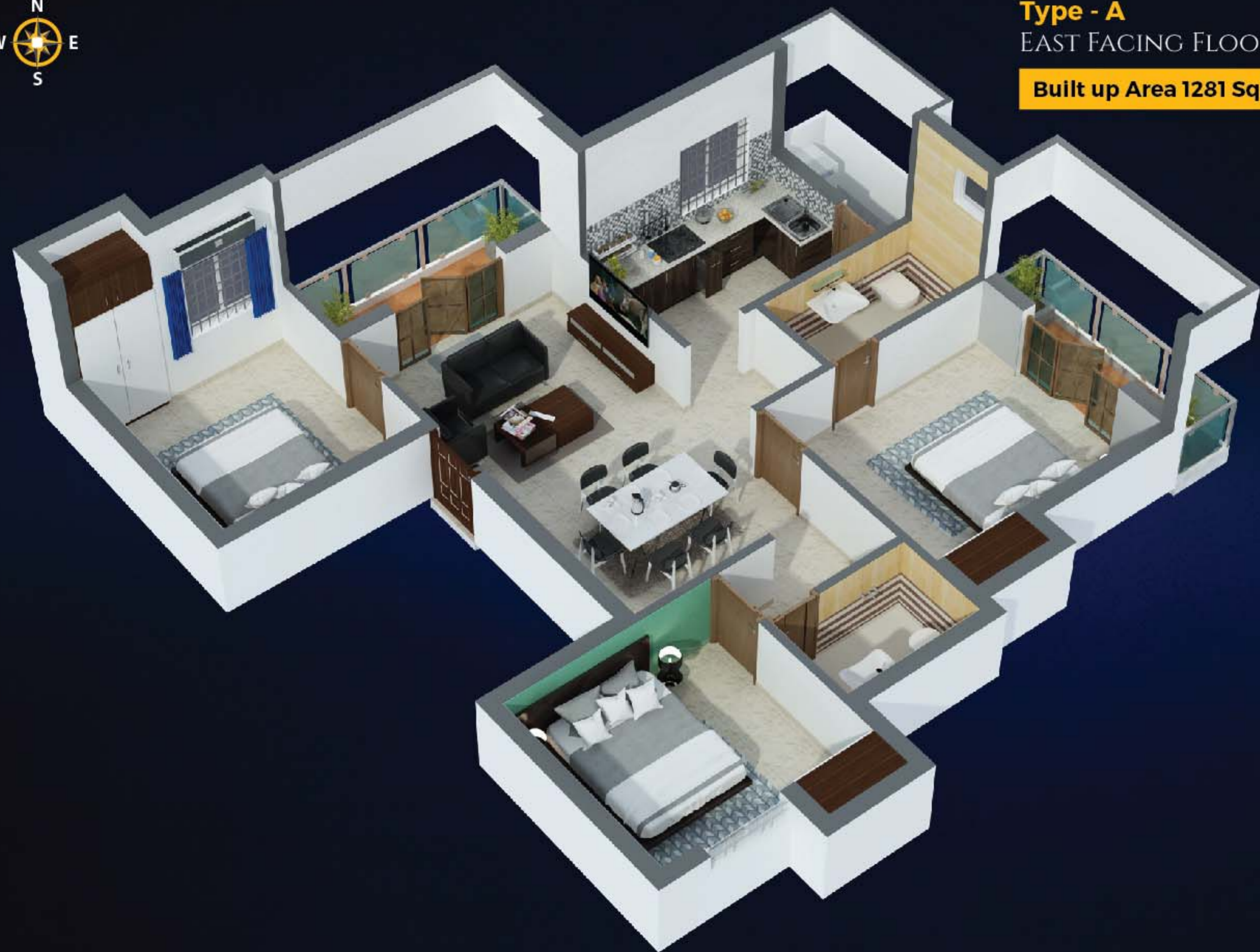
3D FLOOR PLAN