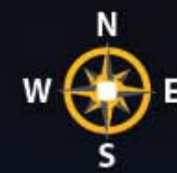
Type - B EAST FACING FLOOR PLAN