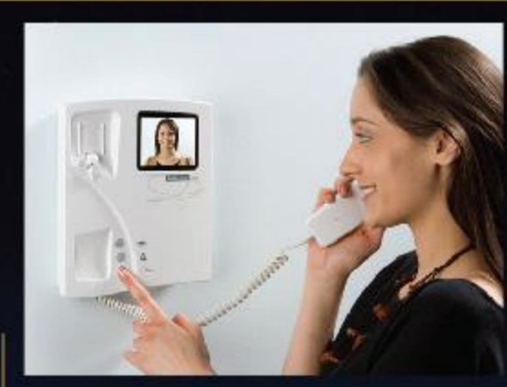
VIDEO DOOR PHONE & Bell For All Houses