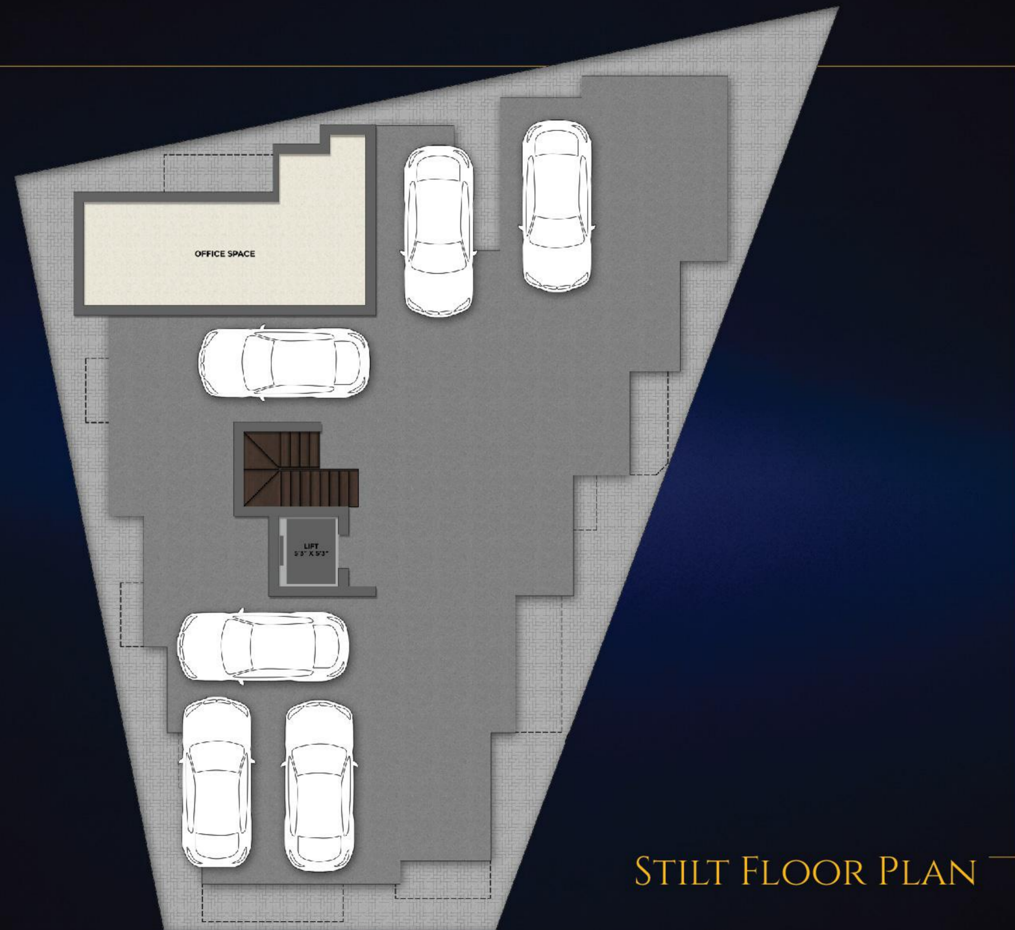
STILT FLOOR PLAN