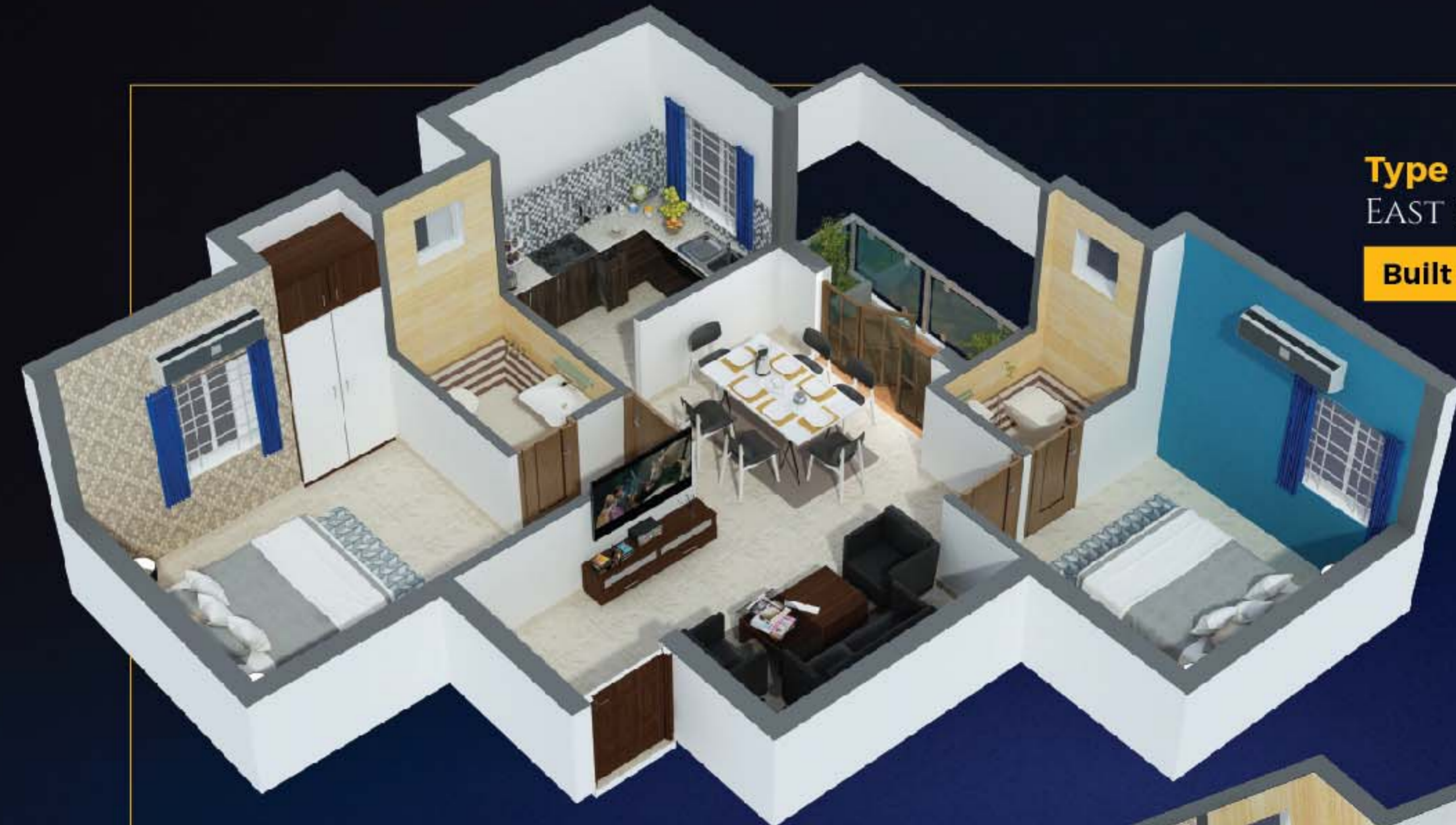
Type - C EAST FACING FLOOR PLAN