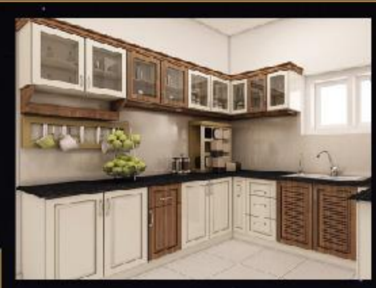
FULLY FURNISHED Modular Kitchen