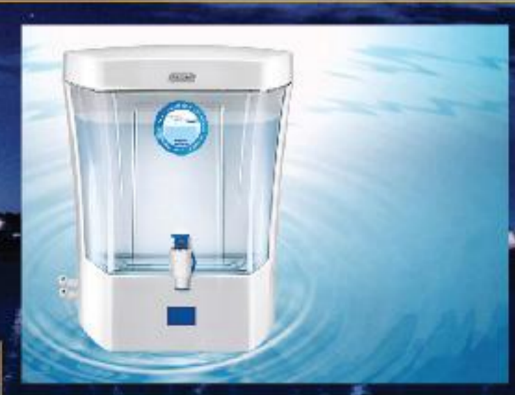
RO DRINKING Water System