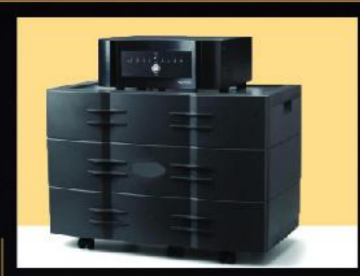
INVERTER Power Backup