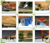
ACTUAL SITE PHOTOS