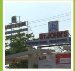
St. John's School