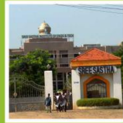
Sree Sastha College