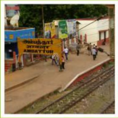
Ambattur Rly. Stn.