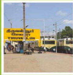
Tiruvallur Rly. Stn.