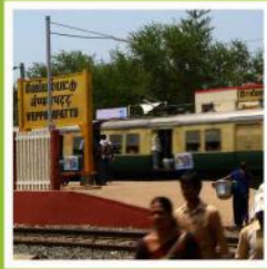
Veppampattu Rly. Stn.